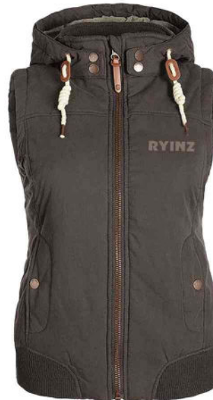
GMSJ-0027 OUTER SHELL: COTTON/ZEAN FABRIC LINING: MICRO MESH