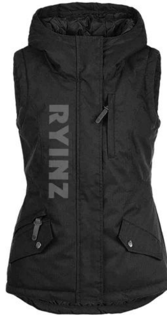
GMSJ-0028 OUTER SHELL: SOFTSHELL