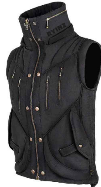
GMSJ-0030 OUTER SHELL: SOFTSHELL OR ULTRA III TECH LINING: Polar fleece