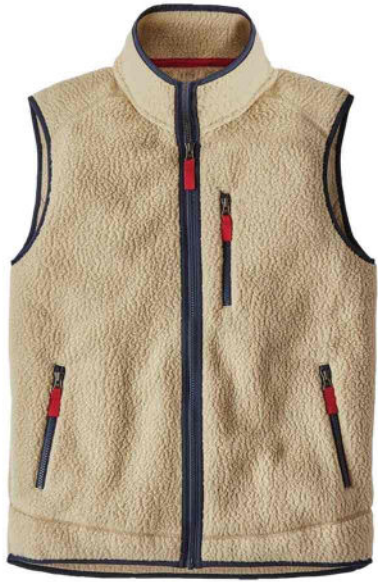
GMSJ-0032 OUTER SHELL: POLAR FLEECE