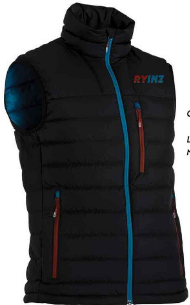
GMSJ-0031 OUTER SHELL: LIGHT WEIGHT FABRIC QUILTED LINING: NO LINING