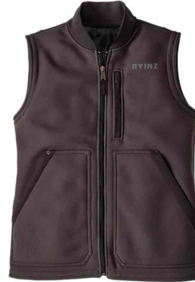
GMSJ-0029 OUTER SHELL: ULTRA III TECH LINING: MESH LINING